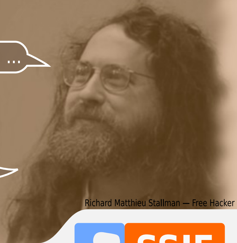
Richard Matthieu Stallman — Free Hacker

... sur les 11 millions de Franciliens !